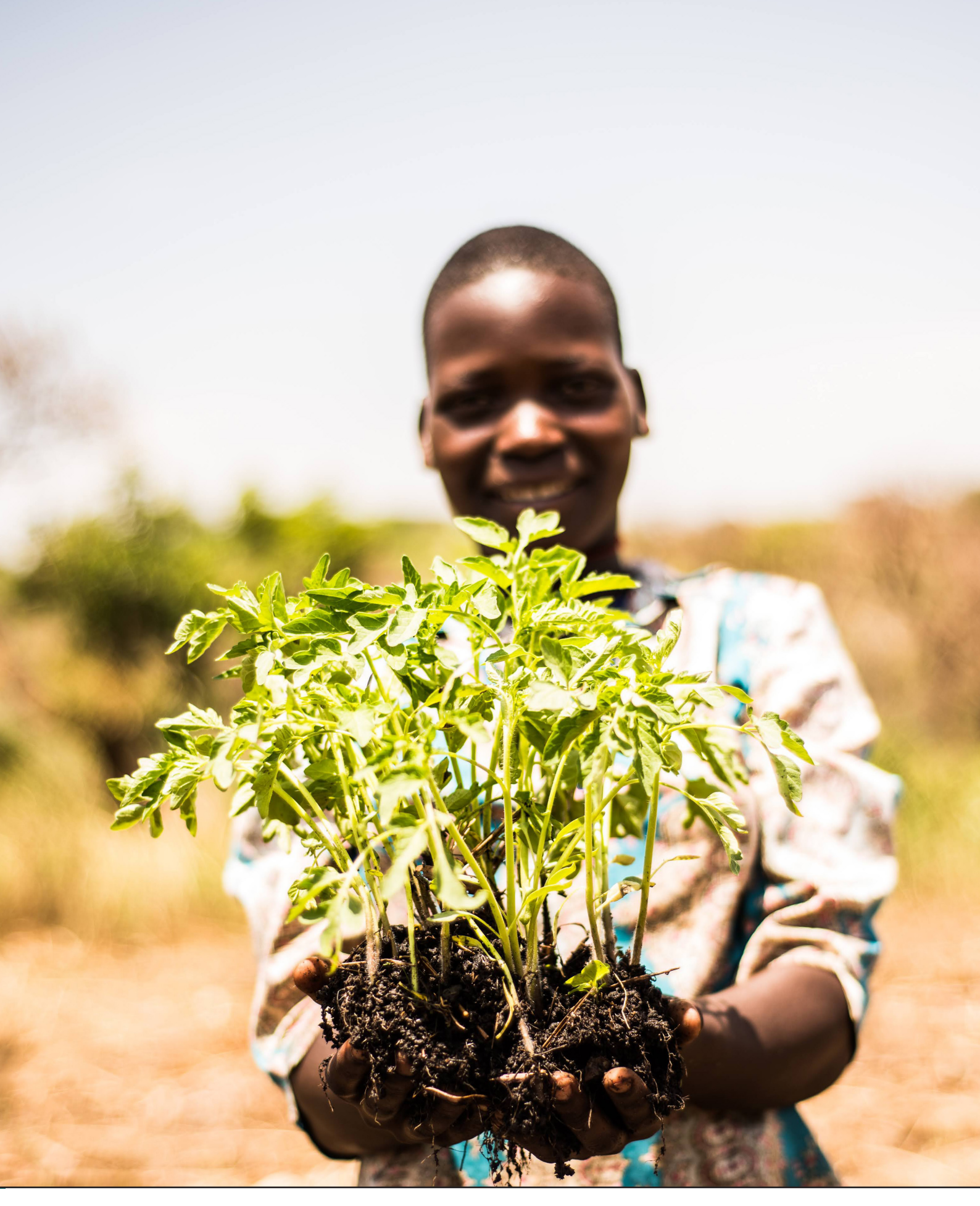
For more information, contact: Uganda National NGO Forum Plot 25, Muyenga Tank Hill Road, Kabalagala Muyenga Road, Kampala P.O. BOX 4636, KAMPALA